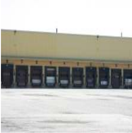
23 Dock Doors