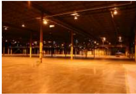
30' ceiling height 40 x 50 bays